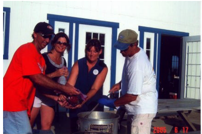
This month's Blue Plate Dinner was a fabulous Shrimp Boil.