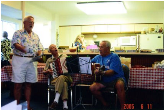
Unparalleled entertainment during our Cruise to BYC!