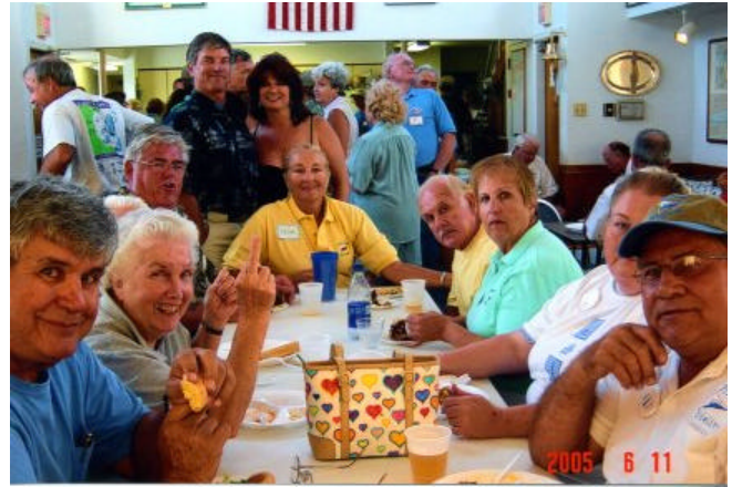
Affirming friendships . . . old and new!