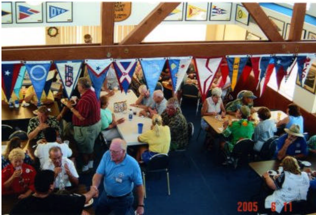
Bay Yacht Club gathering during the PIYC Cruise to BYC.