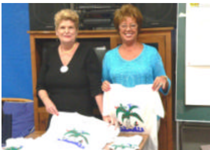
La Posada T-Shirts