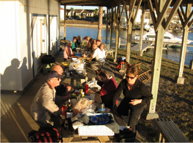
INSTALLATION BANQUET 2007